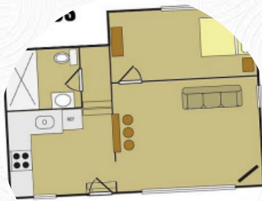
The Loon's Nest - Annex 302