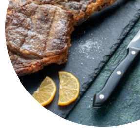
Table At Fort Plain Menu