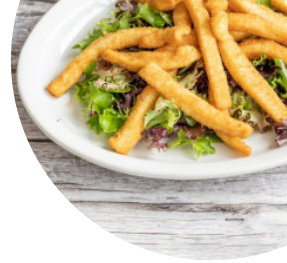
Table Twelve Menu