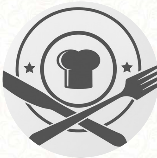
Table 26 Degrees Menu