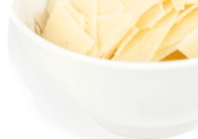
Table 26 Degrees Menu