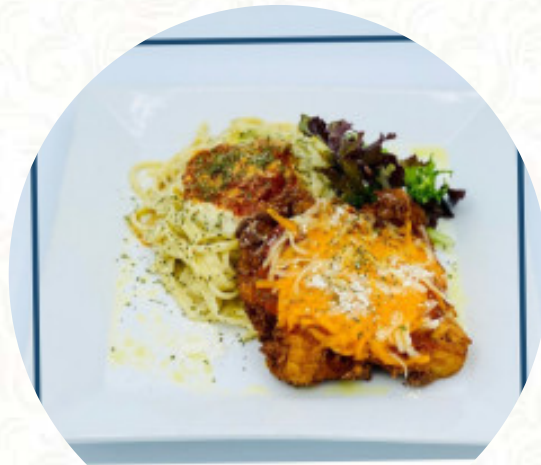
CHICKEN PARMIGIANA PASTA www.HardyJohns.com