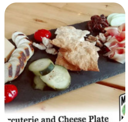
Charcuterie and Cheese Plate