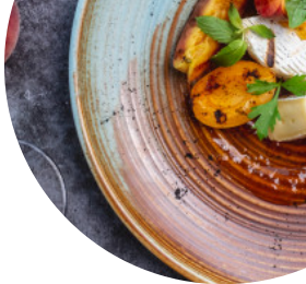
Table 67 On The Riverwalk Menu