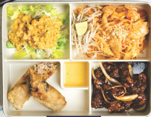
Noodle Box A